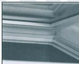
Superior Weatherstrip Design & Location