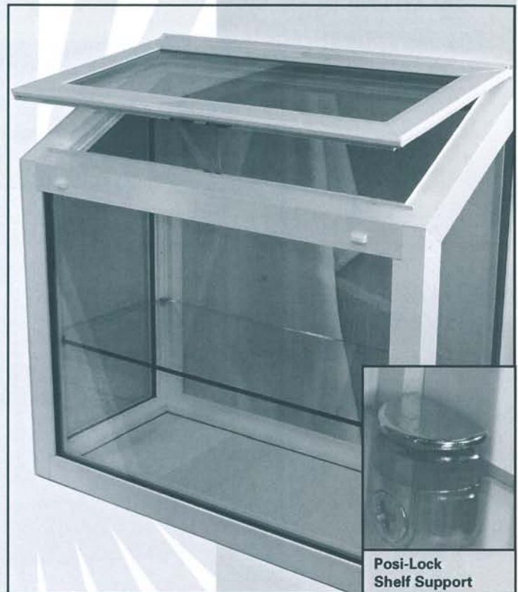
Posi-Lock Shelf Support