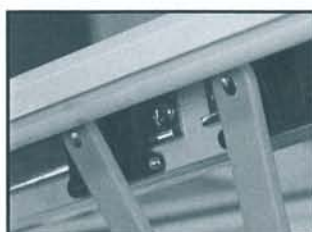
Dual-Arm Positive Locking Hardware