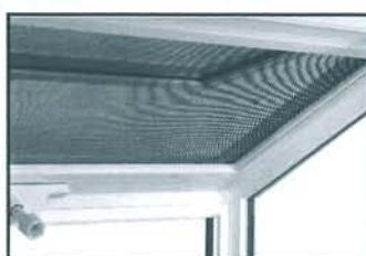
Tight fitting screen with no unsightly clips.