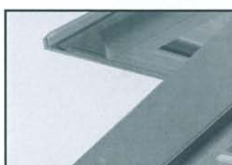
Fusion welded frame and sash.

Integral WINDOW SYSTEMS Becoming part of your plans.