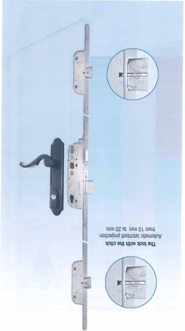
The lock with the click Automatic latchbolt projection from 10 mm to 20 mm